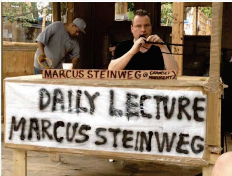
The Philosopher Is In