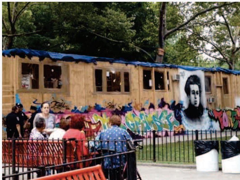
Gramsci Monument (with portrait of philosopher Antonio Gramsci)